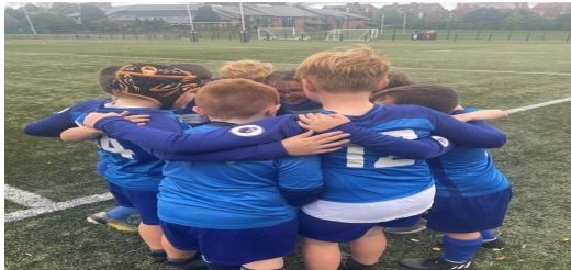
Year 5s in a huddle before one of their games.

As a Federation we are inspired by the children we serve...all 462 of them from Nursery up to Year 6. They are our shining light and our best ambassadors. We are truly proud of them all and aim to provide the best possible education for them. They take all their responsibilities very seriously, give us good feedback on how to improve the Federation and engage with all that we do