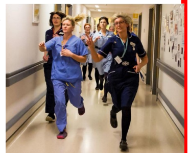
Are some jobs more important than others?